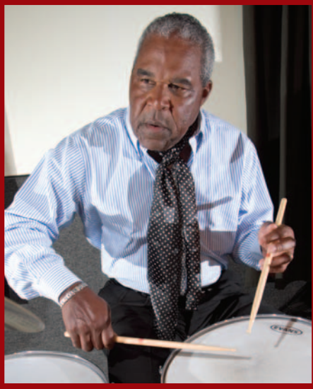
Concerto At Dawn.